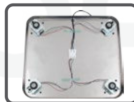
Load Cells from Internal frame