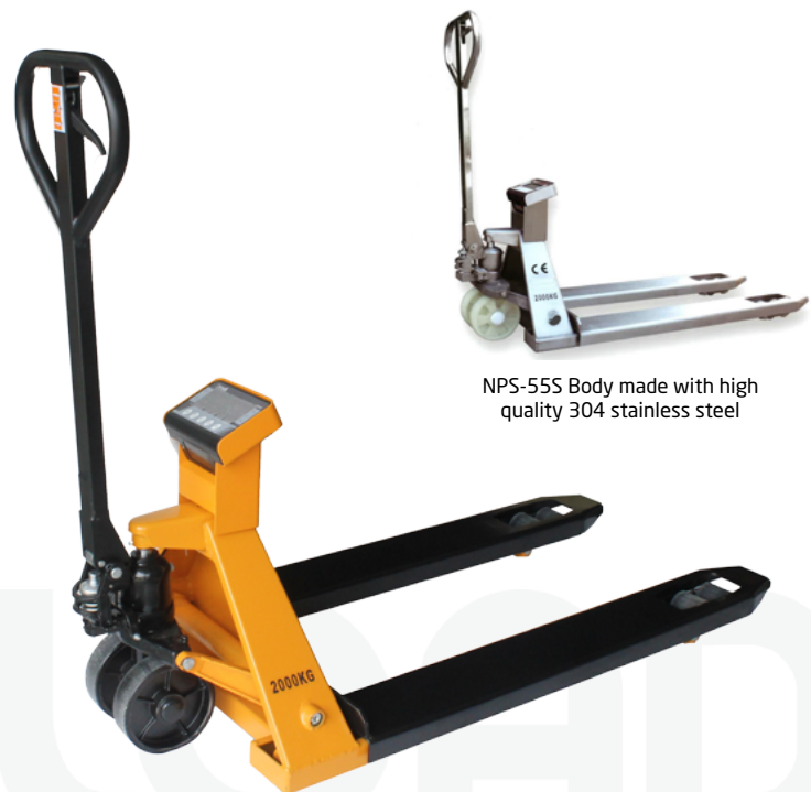
NPS-55S Body made with high quality 304 stainless steel