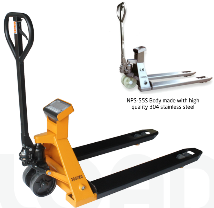
NPS-55S Body made with high quality 304 stainless steel